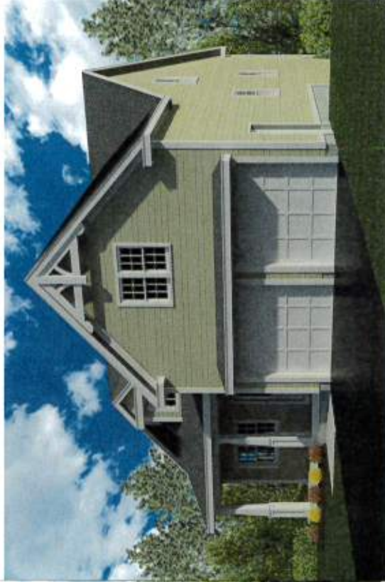
FRONT-RIGHT 3D ARCHITECTURAL VIEW NO SCALE

NO SCALE DATE: 10/24/2024 DRAWN BY: J. ALBERT CHECKED BY: J. ALBERT