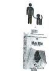
MUTT MITT STATION