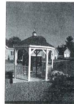
PROPOSED GAZEBO WITH MAILBOXES