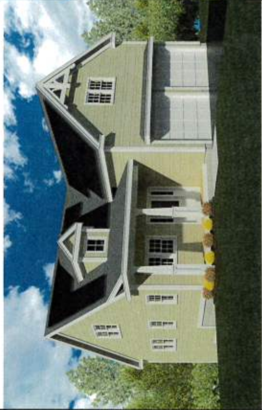
FRONT-LEFT 3D ARCHITECTURAL VIEW NO SCALE