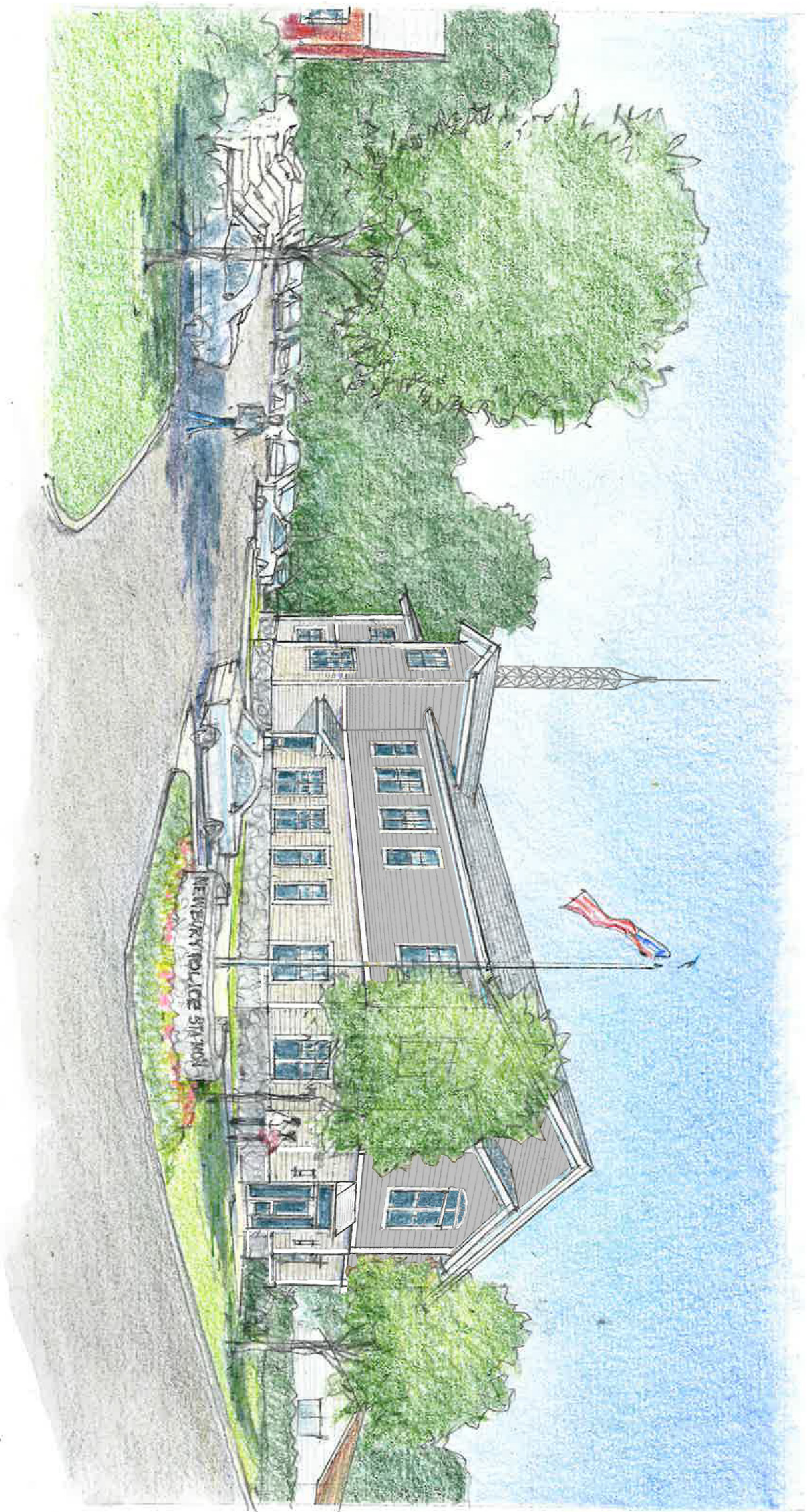
PERSPECTIVE RENDERING OPTION 3 Clapboard on top with flair (light grey) Clapboard below Panel Base (off white) Front door with awning, window above with curved transom