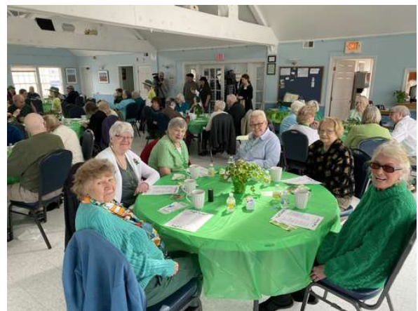
St. Patrick's Day Luncheon at PITA Hall